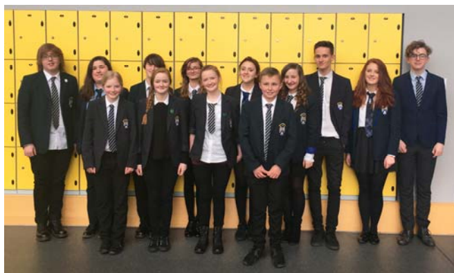
Madras College Entrants

All first and second places go to the Nationals on 23rd April 2016 in Edinburgh.