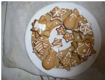
Hospitality Practical Cookery (S4-6) class have created gingerbread wreaths.

The Transition Programme at Madras was recently praised by HMIE in their Inspection Report.