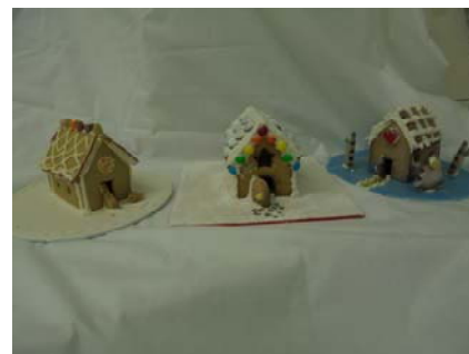
They may be snowed in for Christmas!